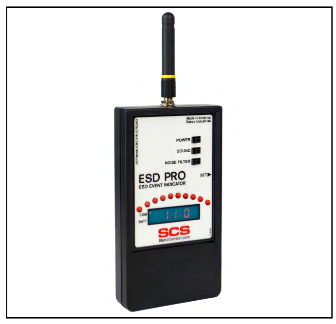
Figure 1. SCS CTM082 ESD Pro - ESD Event Indicator