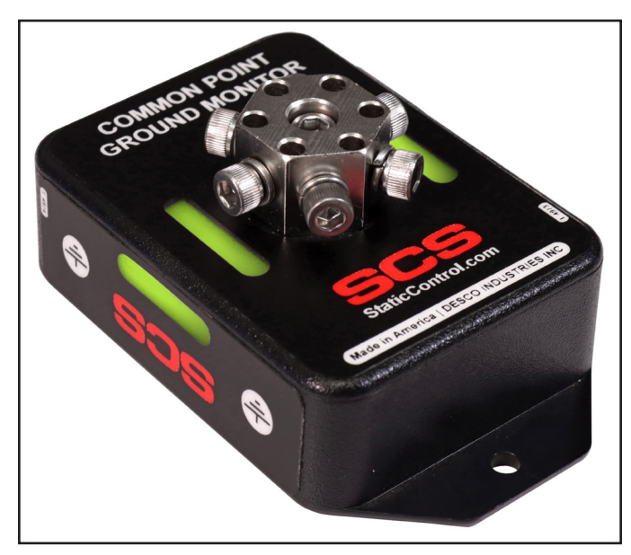
Figure 1. SCS Common Point Ground Monitor