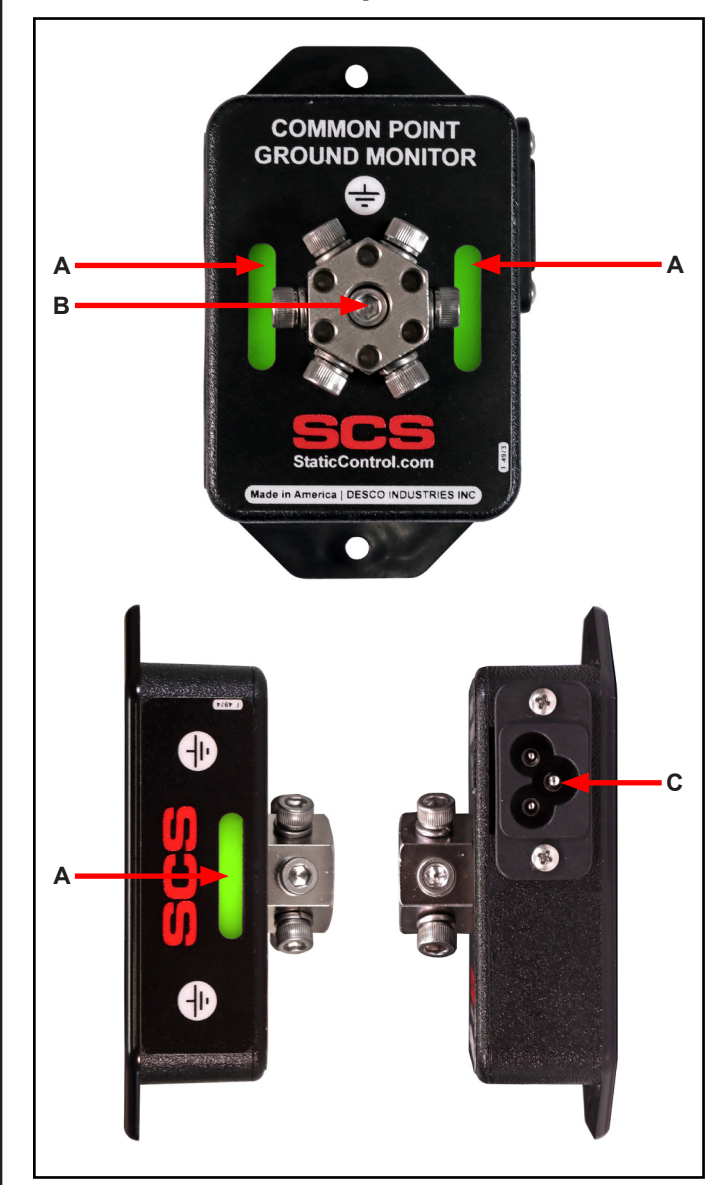
Figure 2. Common Point Ground Monitor features and components