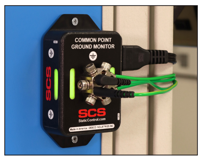
Figure 4. Using the Common Point Ground Monitor

Use the banana jacks on the ground hub to connect banana plugs to ground. Use the 6 included socket head screws and split washers to secure ground wires with ring terminals.