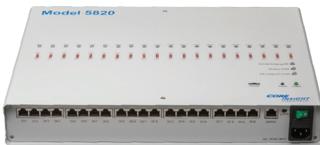
Model 5820 Ionizer Monitoring System