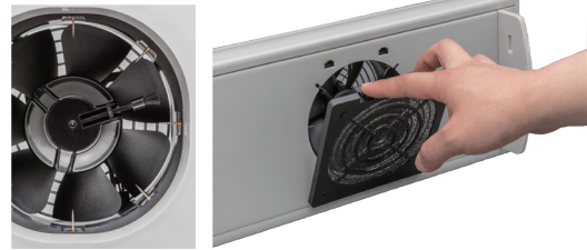
Auto-Cleaning Brush and Grille Opening