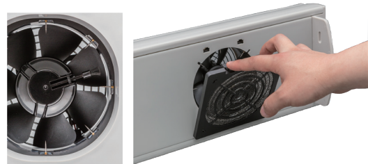
Auto-Cleaning Brush and Grille Opening