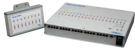
Model 5808, 5820 Ionizer Monitoring System