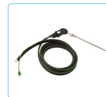
Sampling Probe (E85AACSF13)