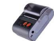
Wireless Bluetooth Printer