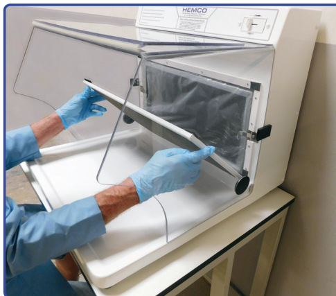
Install particle prefilter and attach using velcro