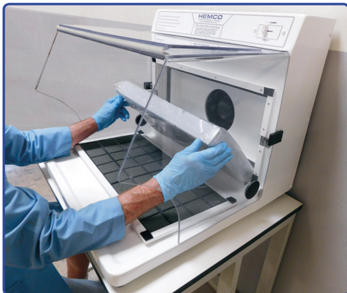
Remove plastic wrap from carbon filter & snap into place using filter clips