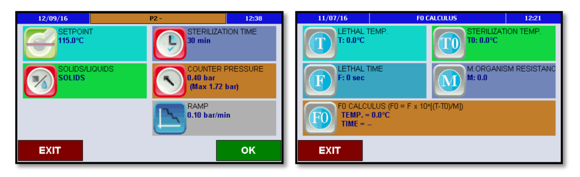
Pantalla selección de parámetros

Water Filling – Connection port to the water mains to fill automatically the sterilization chamber and cool it down by internal sprinkle.